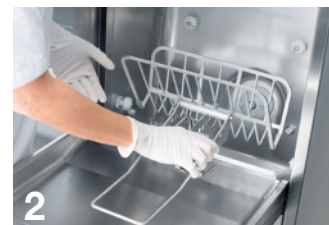
2 Fit TopCut B with the aid of an intelligent rapid exchange system