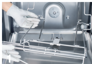
1 Just take out the racks for normal care utensils