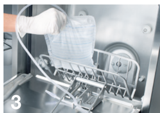
3 Insert the urine or secretion bag