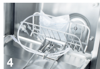
4 Close the door and the bag is opened automatically