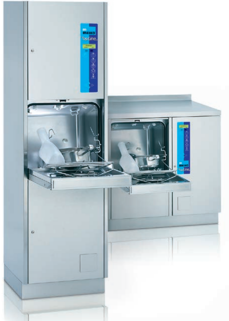
TopLine 20 floor model and TopLine 40 table top model with automatic door-opening (optional) and foot switch (optional).

TopLine 20 & TopLine 40 – hands-free opening and closing or using the foot switch