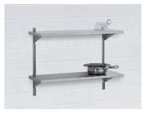
Wall shelving* Rack with height-adjustable shelves available in all shelf lengths. Shelf depth: 350 mm.

Cupboard units with hinged doors and one intermediate shelf. Available in widths of 500 mm, 600 mm, 800 mm, 1000 mm, 1200 mm and 1500 mm.