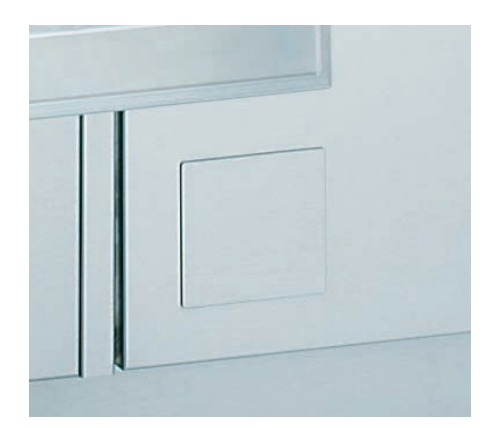
Opening and closing by using the foot switch (optional).