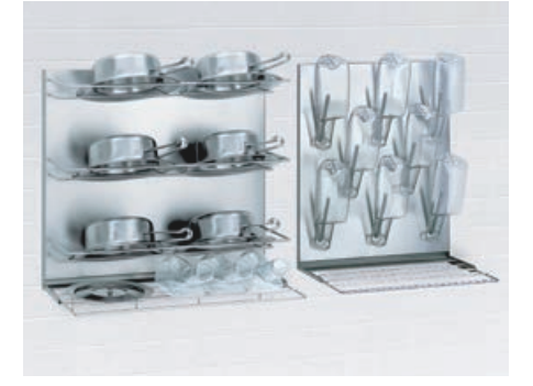
Drying and storage racks*

In addition to the MEIKO cleaning and disinfection technology, we can also supply you with a comprehensive range of accessories for safe and ergonomic working and the hygienic storage of care utensils. We illustrate below 6 examples of practical solutions. We would be happy to develop a range of suggested solutions specially for you. Just give us a call. We would be pleased to help you at a moment's notice.