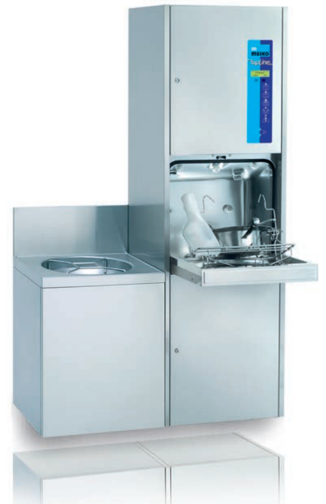
A practical and compact work unit consisting of the TopLine 10 cleaning and disinfection appliance and a slop sink specially designed to accompany it.

Dimensions (mm): w 500, d 450 or 588, h (appliance) 1630