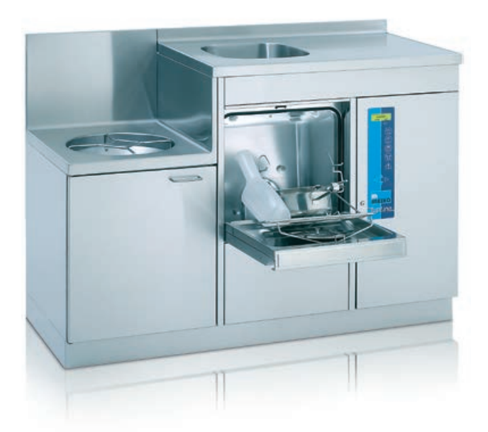
The SAN 14 B compact combined care unit for care needs in the dirty utility room, complete with work and storage surface, splash screen, slop sink, hand wash basin and upstand.

Dimensions (mm): w 1400, d 600, h 900 Slop sink: h 700 Sink: Ø 362